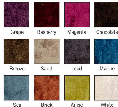
Grape Raspberry Magenta Chocolate Bronze Sand Lead Marine Sea Brick Anise White